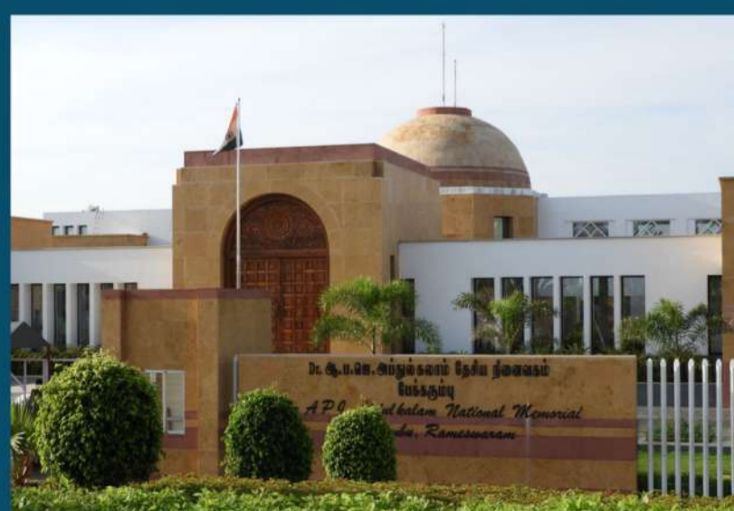
Dr.A.P.J.ABDUL KALAM MEMORIAL RAMESHWARAM (225 km)