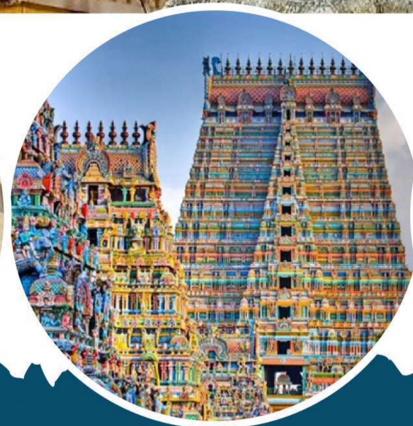
SRI RANGANATHASWAMY TEMPLE