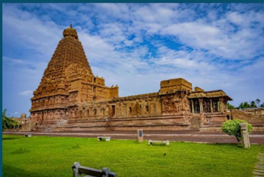
BRIHADEESWARA TEMPLE, TANJAVUR (60 km)