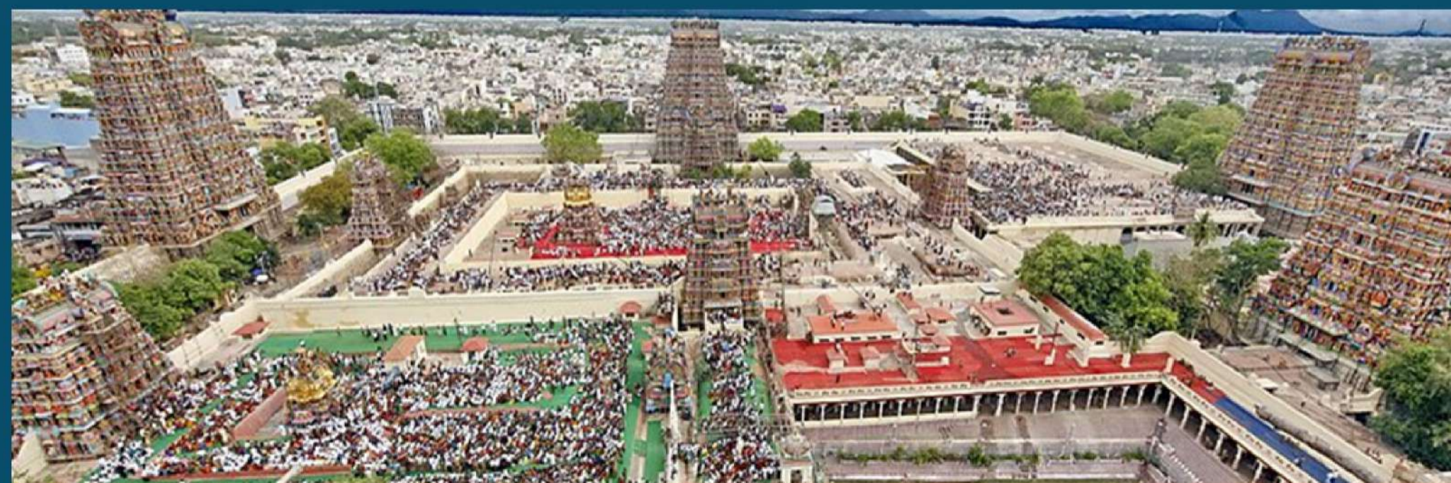
MEENAKSHI AMMAN TEMPLE, MADURAI (130 km)