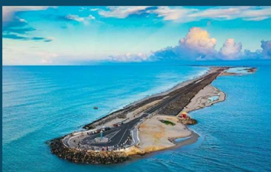
DHANUSHKODI, RAMESHWARAM (250 km)