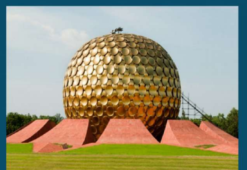
AUROVILLE, PUDUCHERRY (210 km)