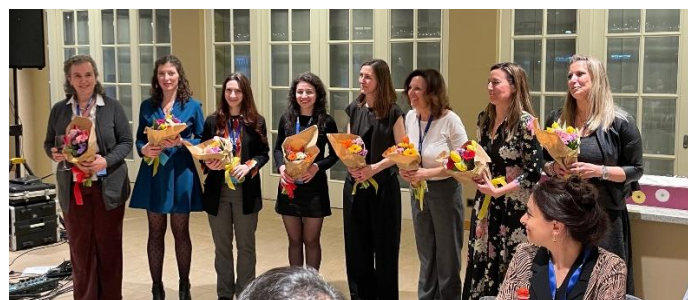
The local organising committee members receiving flowers during the gala dinner in recognition of their hard work.