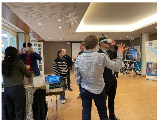
Delegates experiencing the human-computer interaction devices of the keynote presentation “Augmented infrastructure condition diagnosis – from bridges to cathedrals”.