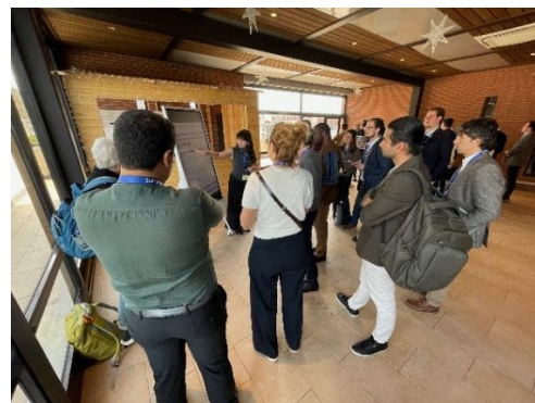
On the left: the RILEM desk with the RILEM/Springer publications. On the right: a moment during the poster session.