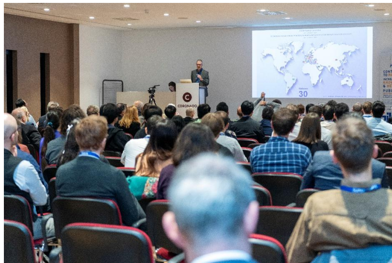
The opening session of the Conference on Durability of Infrastructures.

Amongst the many interesting keynote lectures, the award session of the 2025 RILEM G. Colonnetti medals deserves a special attention: