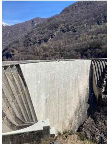
Verzasca Dam, offered as a technical visit to the conference delegates on the last day of the event.

The next RILEM Spring Convention will take place on 13-17 April 2026 at Ghent University, Belgium. It will be organised jointly with the Conference on Innovative Construction Materials and Processes for Sustainable Buildings and Infrastructure .